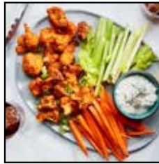
By Jesse Szewczyk epicurious.com